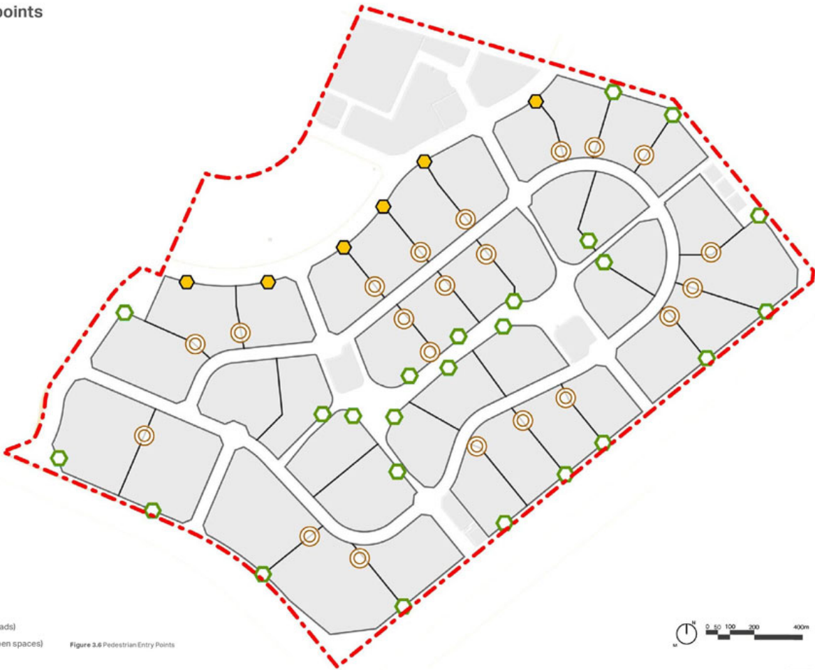
Figure 3.6 Pedestrian Entry Points